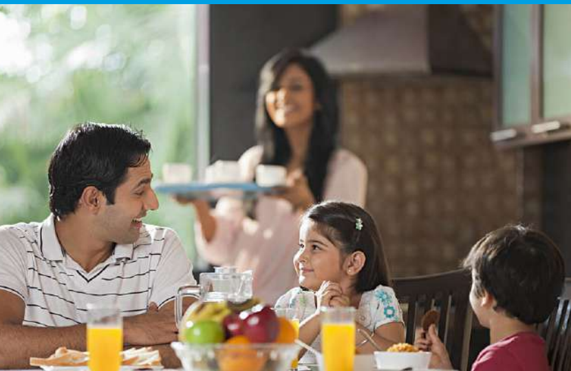
Table Manners for Little Ones